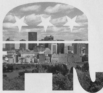
MINNEAPOLIS/ST. PAUL REPUBLICAN NATIONAL CONVENTION